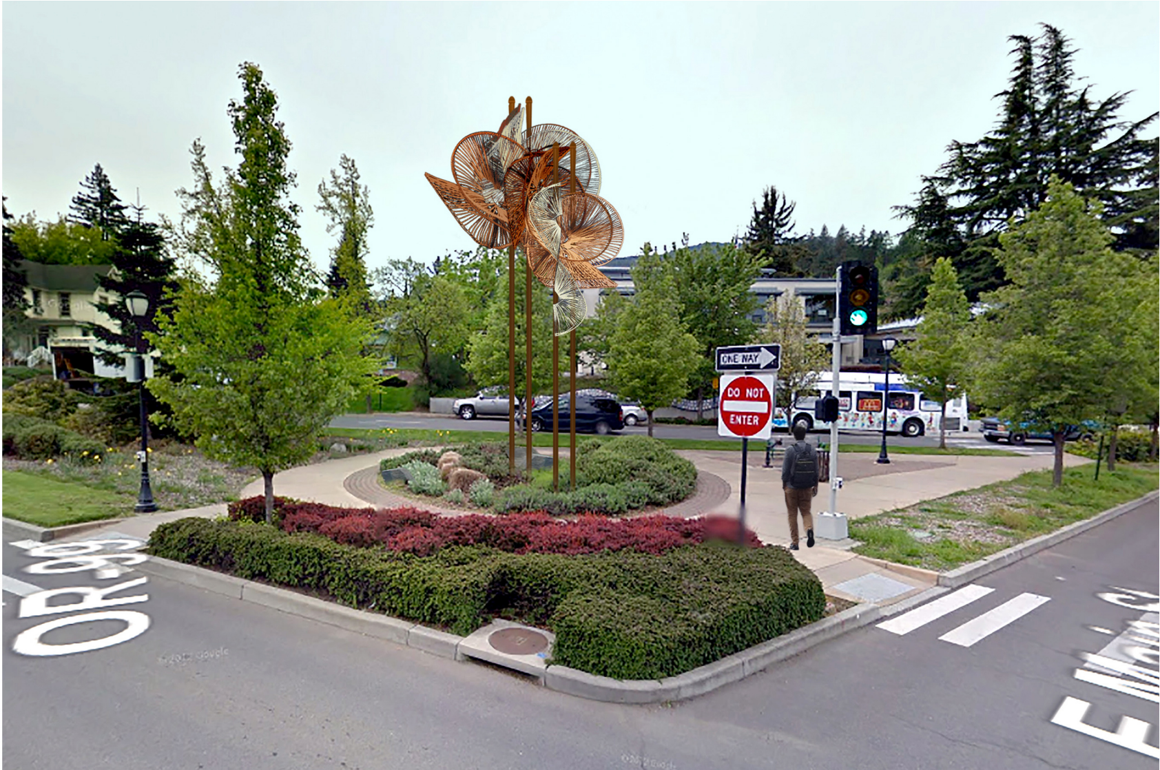
Susan Zoccola Artwork Concept Proposal City of Ashland, Gateway Island May 2016