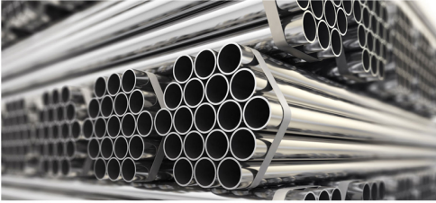
Steel round pipe