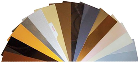
Epoxy paint or powder coat